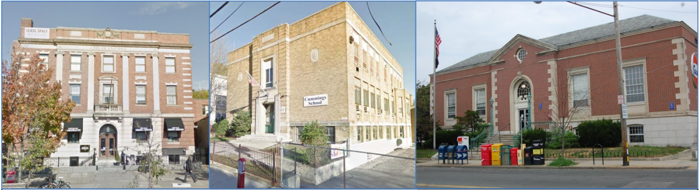
66-70 Union Square (1932), 42 Prescott Street (1931), 237 Washington Street (1935)(LHD)